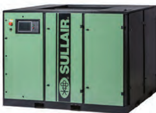
LS90, LS110, LS160