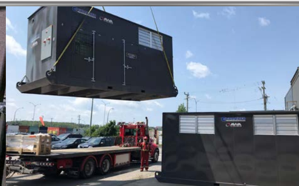
EASY HANDLING WITH LIFTING BRACKETS FOR CRANE